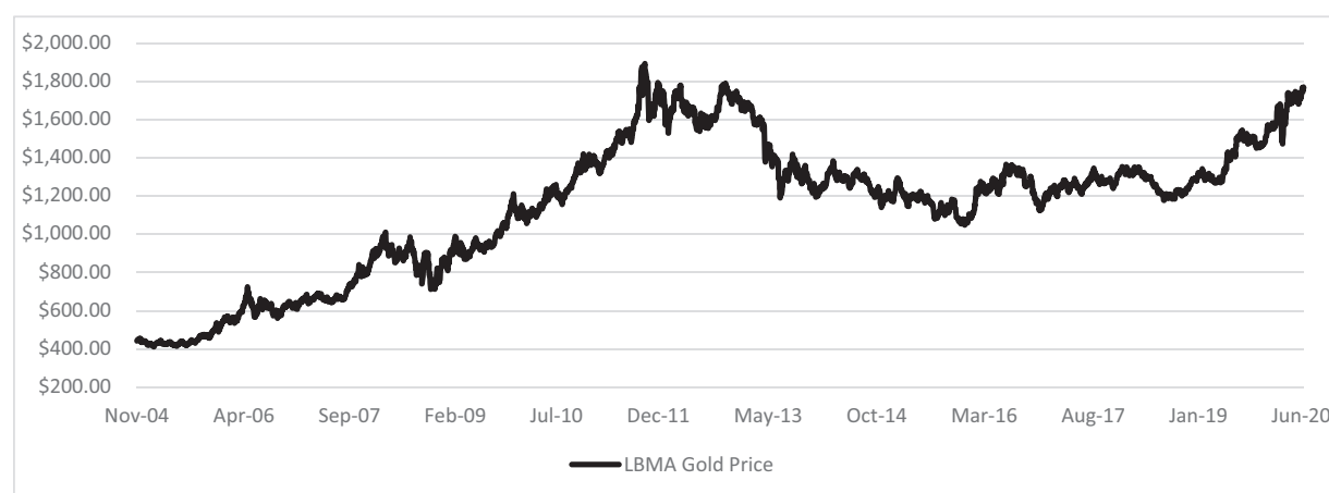
LBMA Gold Price—November 18, 2004 to June 30, 2020

As movements in the price of gold are expected to directly affect the price of the Shares, investors should understand what the recent movements in the price of gold have been. Investors, however, should also be aware that past movements in the gold price are not indicators of future movements. The following chart provides historical background on the price of gold. The chart illustrates movements in the price of gold in U.S. dollars per ounce over the period from the day the Shares began trading on the NYSE on November 18, 2004 to June 30, 2020 and is based on the LBMA Gold Price PM when available from March 20, 2015 and previously the London PM Fix.