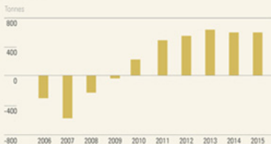
Figure 4: Central Bank Net Sales and Purchases of Gold in Tonnes