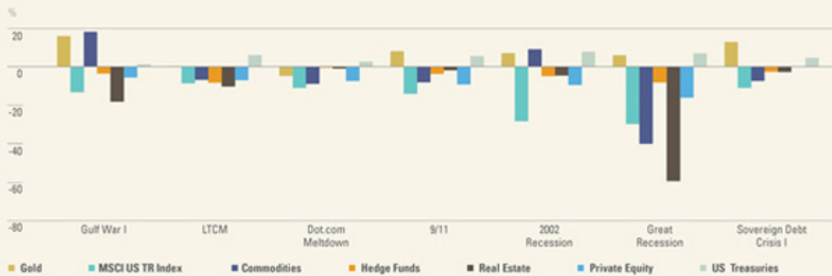
Figure 2: Gold as a Tail Risk Hedge – Performance in Market Downturns