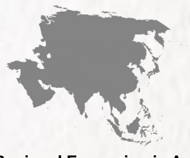
Regional Expansion in Asia