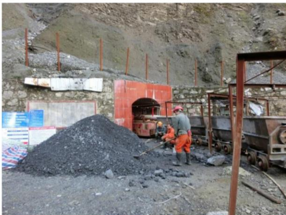
Rail/Tramway system at Mines 矿山轨道车系统