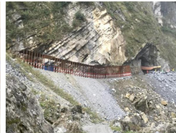
Tunnel construction near mines (redesigned Mian-Mao Highway)