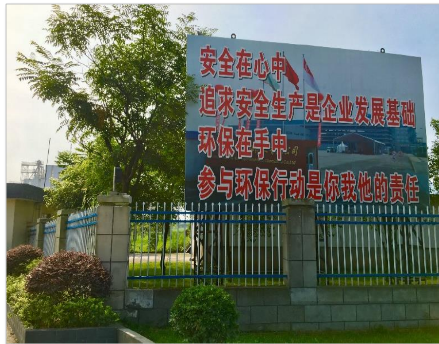
Photo: (Sign board at entrance of our downstream chemical operations factory premises)

We also participate in local community projects in the vicinity of our business operations in Mianzhu City, Sichuan Province, PRC. We seek to support and promote local businesses and economic activities by engaging them as suppliers. Whenever possible, we procure our raw materials from local suppliers within the vicinity of our operations.