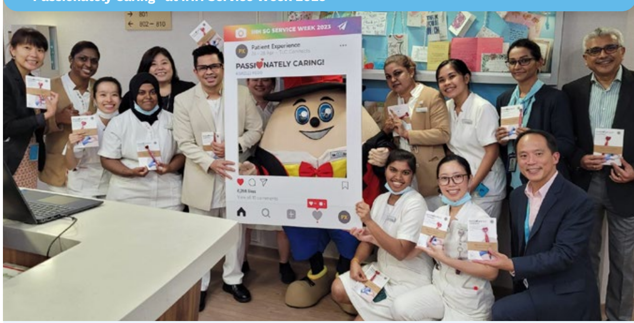
"Passionately Caring" at IHH Service Week 2023

Underpinning the success of Gleneagles Hospital is a team of dedicated medical professionals who recognise the value of collaboration, as well as the need to keep pushing the boundaries of medical science to provide the best possible care. Supported by the latest medical facilities and advanced surgical systems, they provide patients with a renewed hope to overcome their illness and continue living life to the fullest.