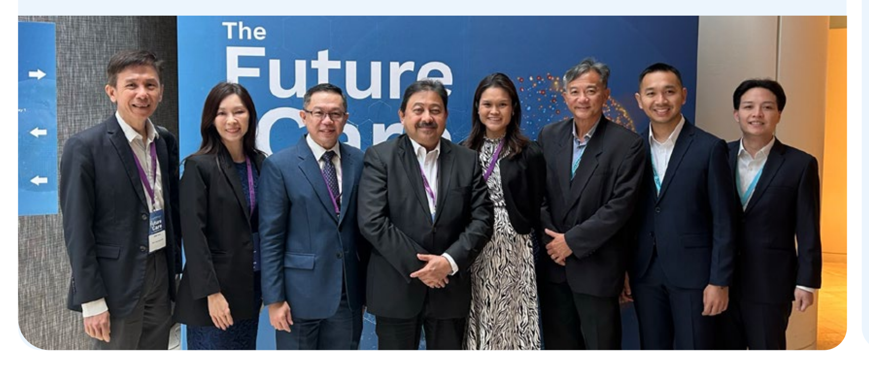
Enhancements to Our Lean Six Sigma Training

In recognition of our staffs' tenacity and drive to deliver the best service and care for our patients, the IHH Quality awards were also presented during the Summit. These accolades serve as a testament to our unwavering commitment to excellence, pushing the boundaries of what is possible in the field of healthcare as we journey on to Care. For Good.