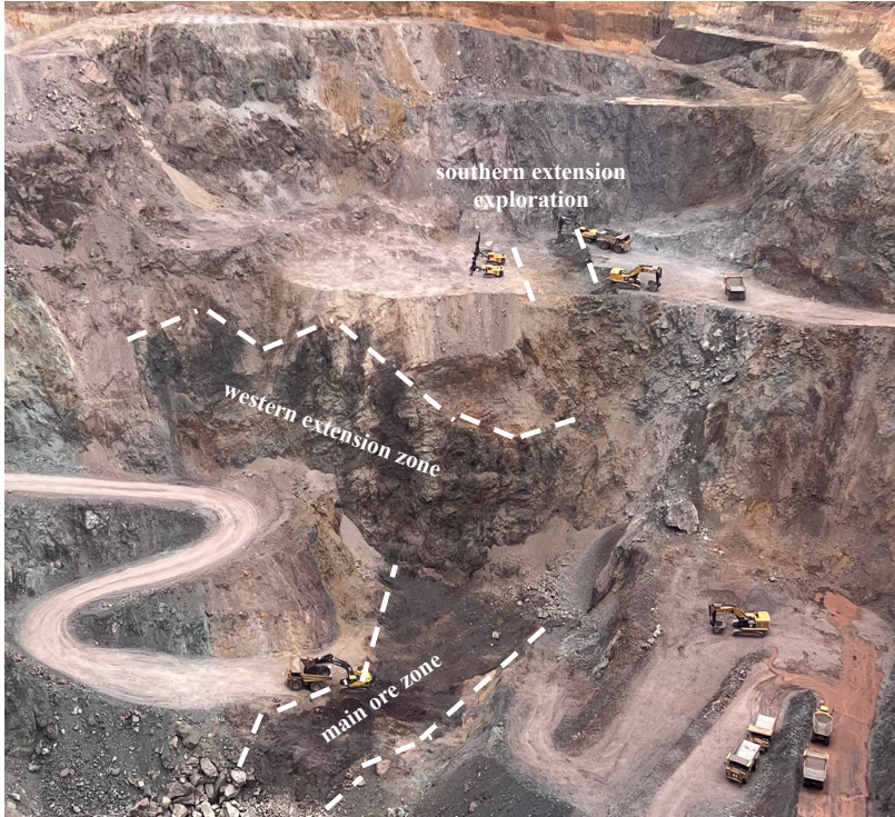
Extension to Existing Iron Ore Body at the Chaah Mine