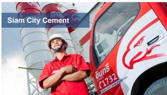
Siam City Cement