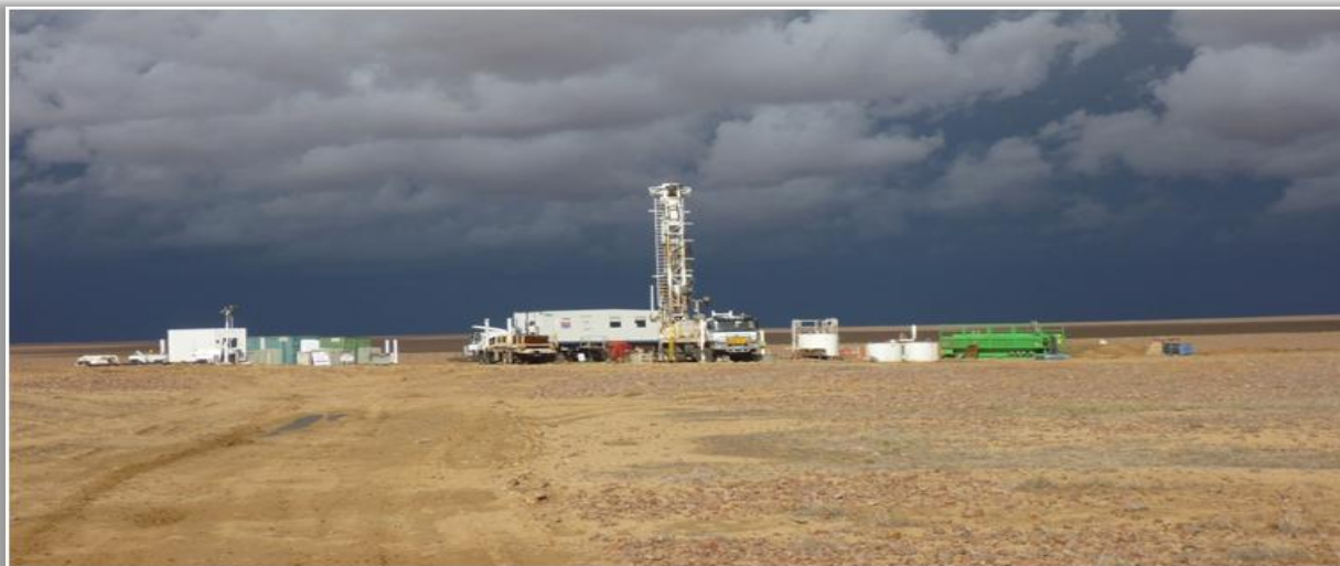
Figure 3: Historical Arckaringa Basin Drilling