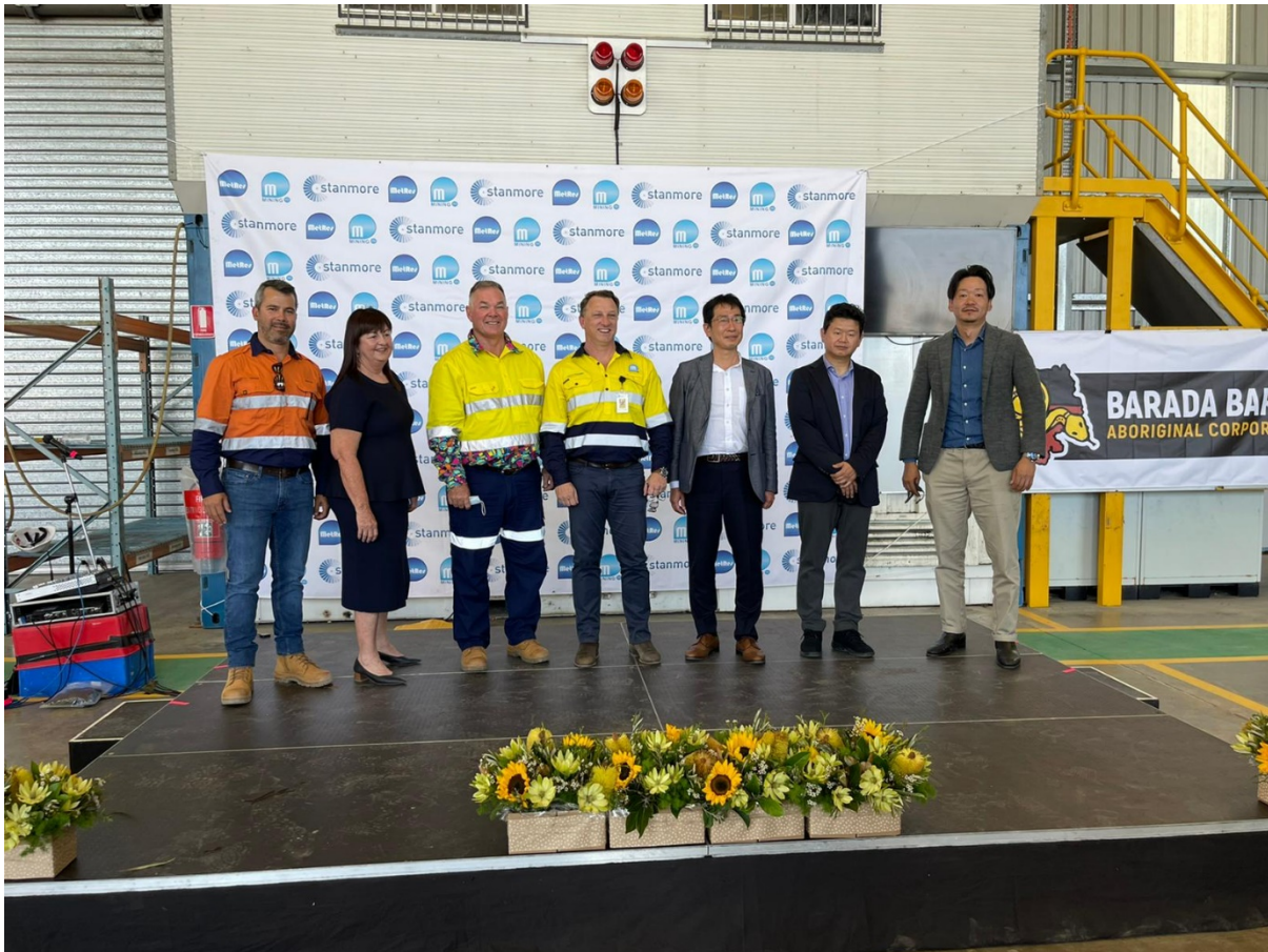
Figure 4: Opening day at Millennium and Mavis Downs mine