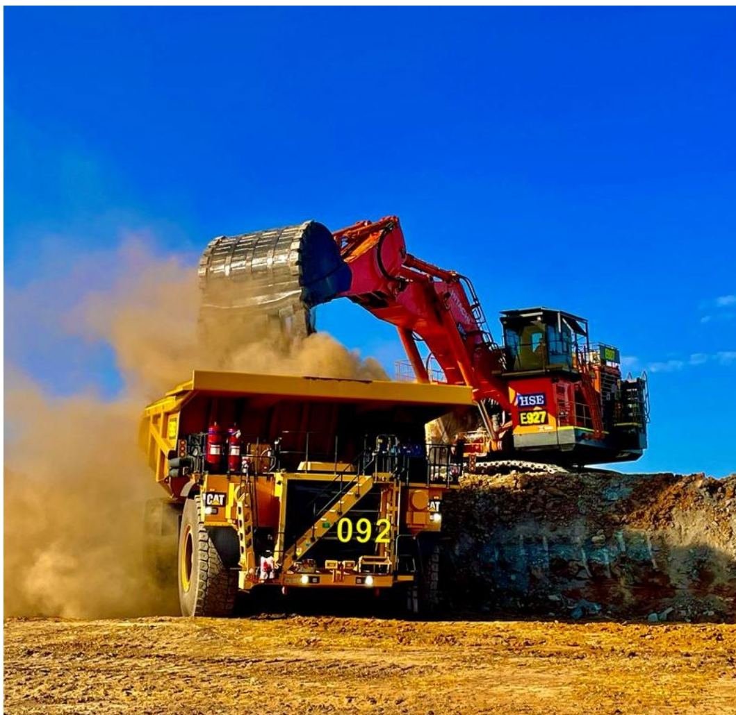
Figure 3: A Hitachi Ex3600 excavator matched with CAT789 trucks has commenced work

As previously announced, contracts are in place for the underground mining operations scheduled for commencement in the second half of 2022.