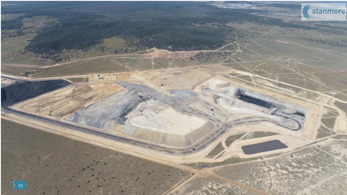
Figure 1: Isaac Downs bulk sample pit, ROM stockpile on the left, and Millennium mine in the far background

The bulk sample pit for the purposes of providing trial cargoes to key customers has been successful with no material coal quality issues raised by key customers.