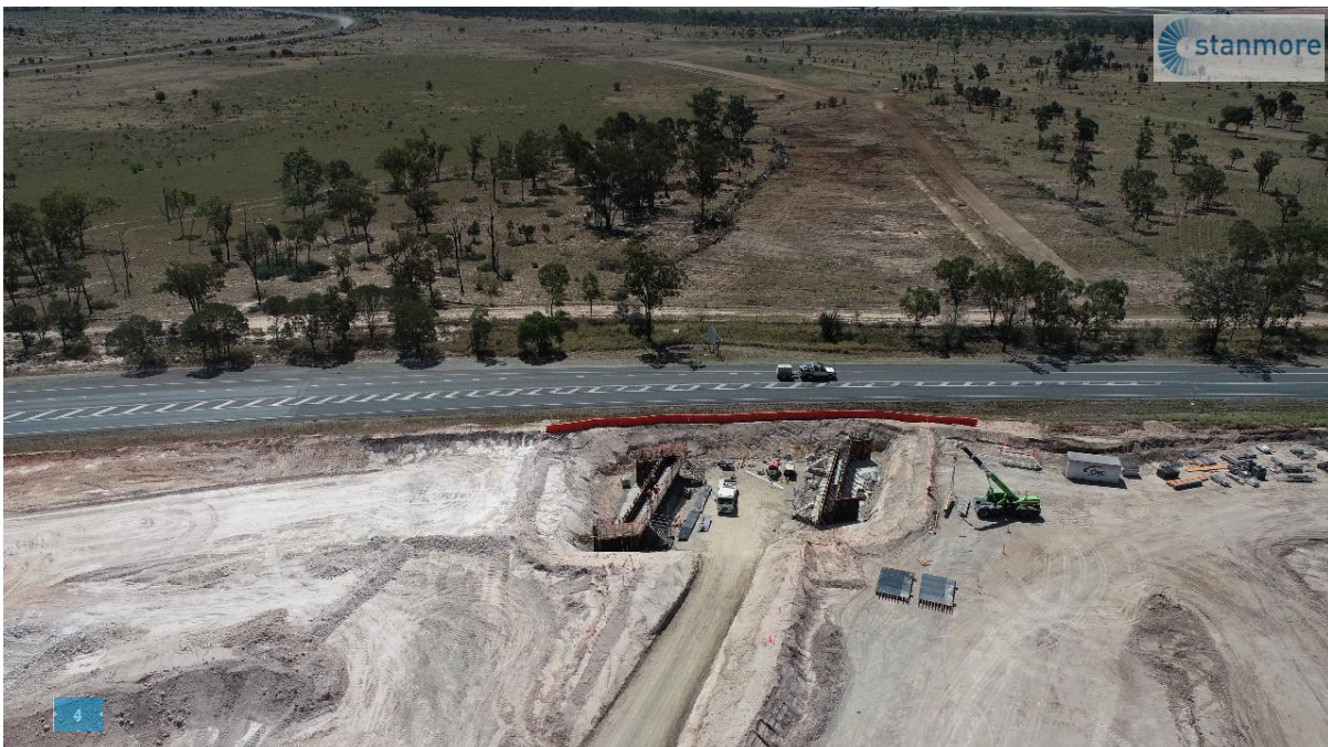
Figure 2: Construction of the concrete underpass bridge next to the Peak Downs Highway