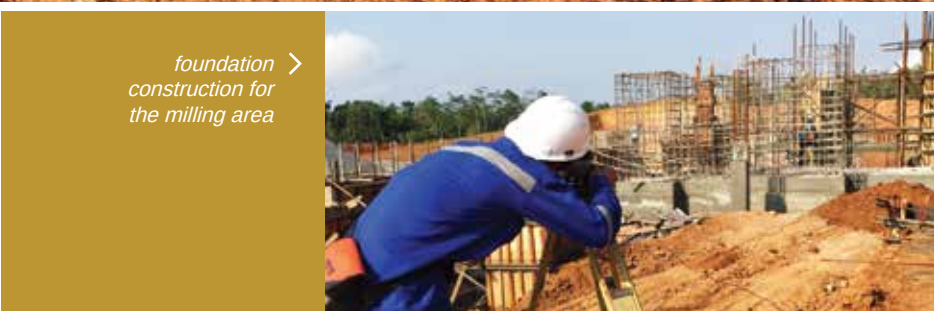
foundation construction for the milling area >