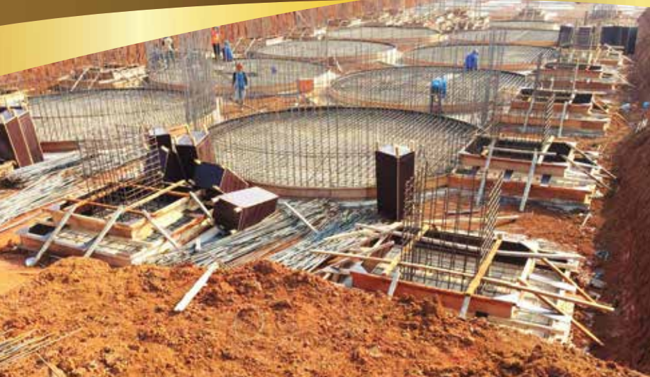
◀ foundation construction for leaching tanks

Besides seeking to develop gold deposits, the Group is exploring the potential of other mineralised areas of the Ciemas Gold Project to build sustainable value for its stakeholders.