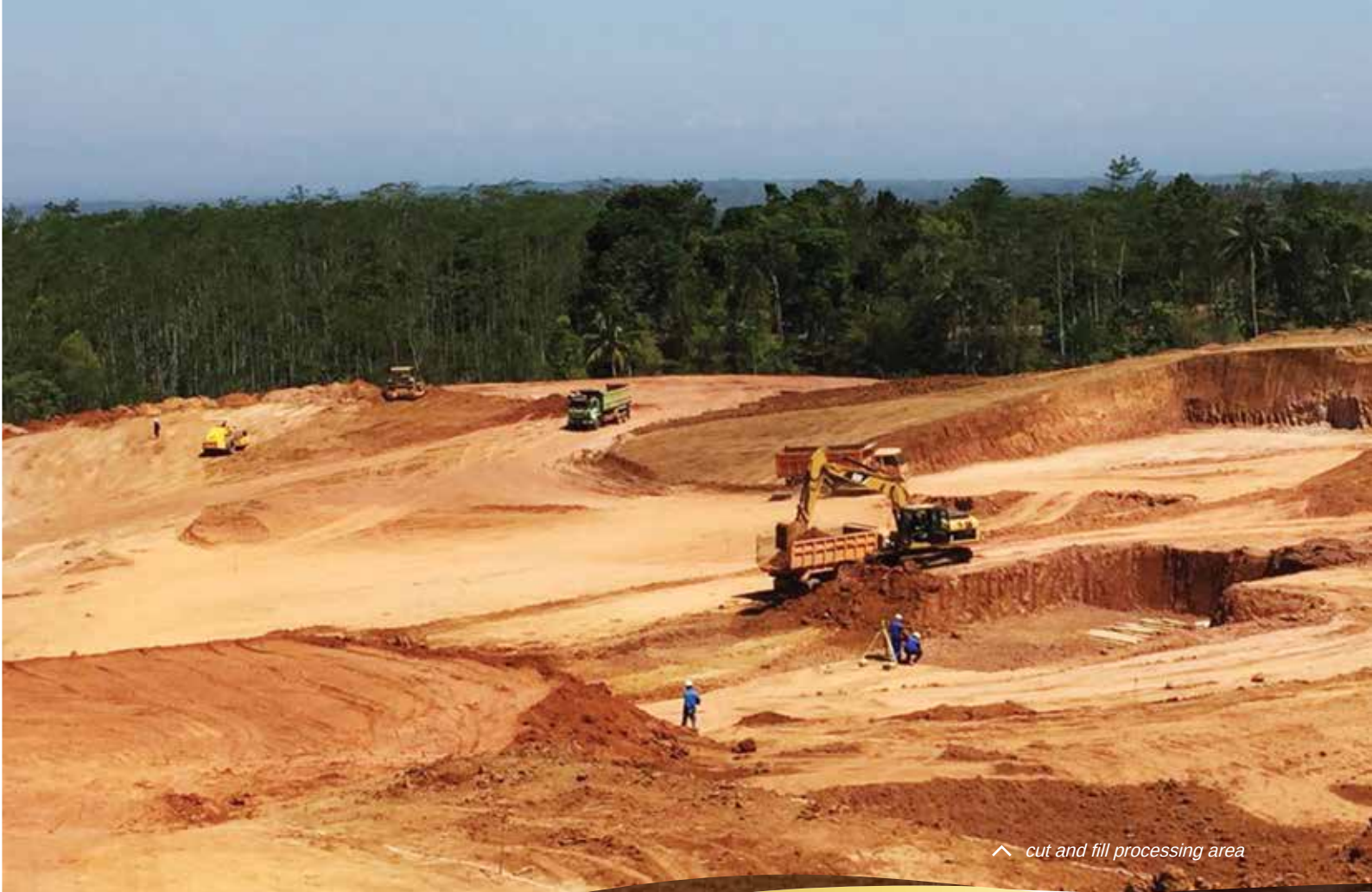
^ cut and fill processing area

\ The Ciemas Gold Project contains estimated mineral resources of approximately 46,058 kg of contained gold 3 \