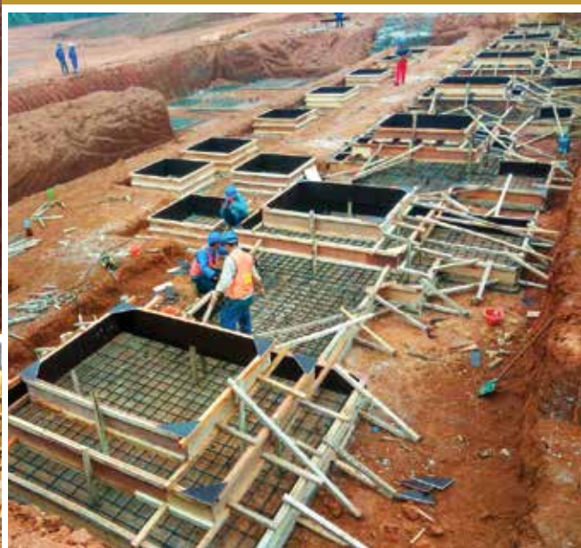
⤴ pouring of concrete foundation