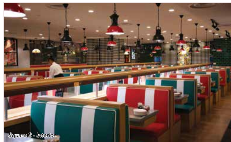
Square 2 - Interior