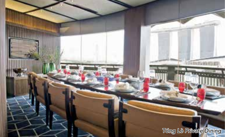
Tóng Lè Private Dining