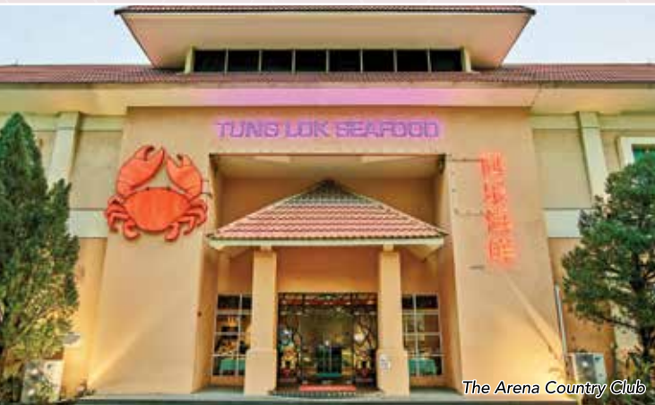
The Arena Country Club