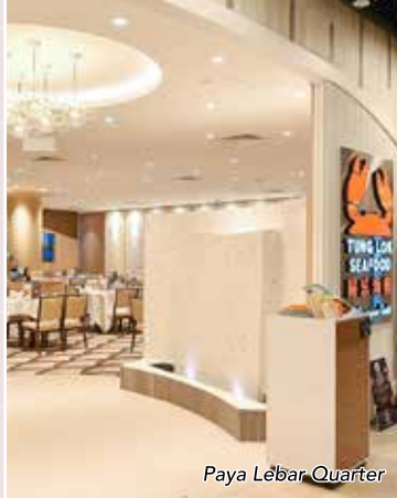
Paya Lebar Quarter