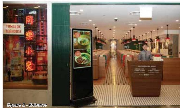
Square 2 - Entrance

23 Merchant Road, Level 1, Singapore 058268 Tel: 6721 9118