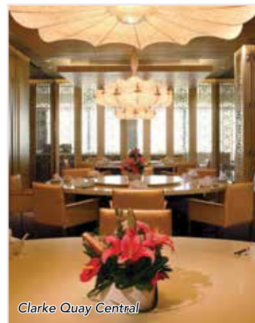
Clarke Quay Central