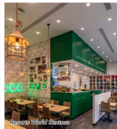
Resorts World Sentosa