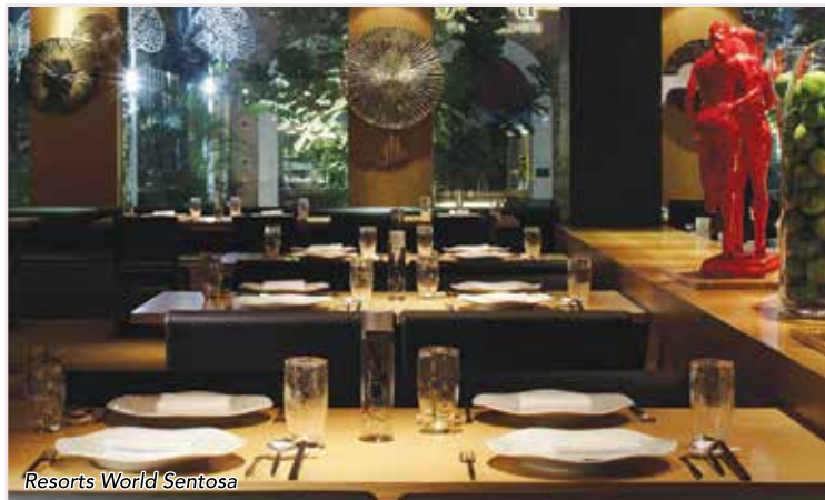
Resorts World Sentosa

Hoa Lan, Vinhomes Riverside Long Bien, 10000 Vietnam Tel: +84-94-9898222