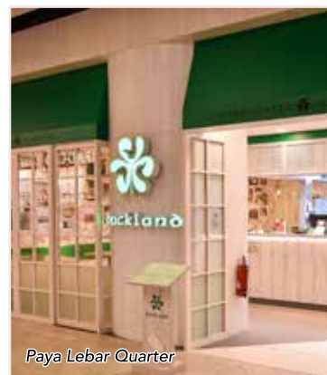
Paya Lebar Quarter