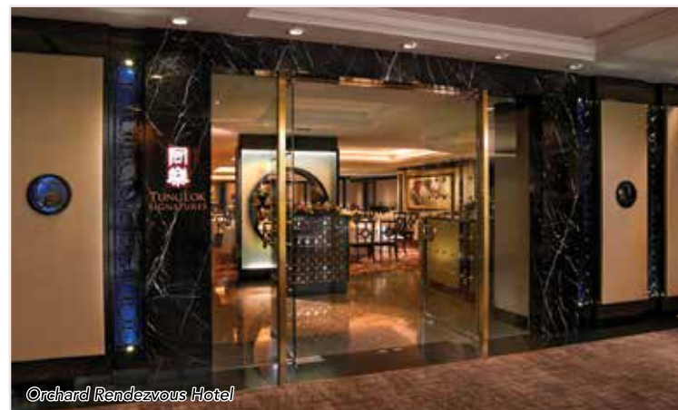
Orchard Rendezvous Hotel

#30, Street 222 , Sangkat Beong Raing Khan Daun Penh, 12211 Cambodia Tel: +855 69 931 888