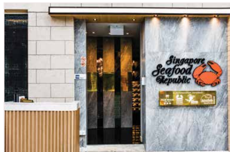
Festive Walk @ Resorts World Sentosa

No. 59 Mao Ming South Road, Jin Jiang Hotel, Shanghai 200020 Tel: +86-21-6445 1717