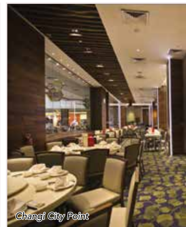
Changi City Point