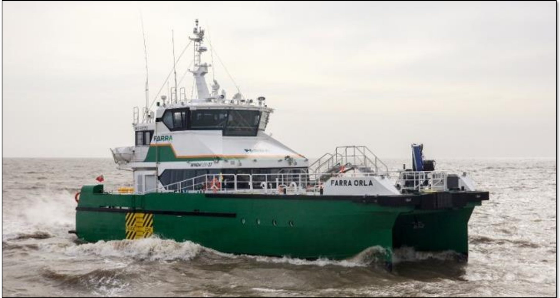
“Farra Orla”: WindFlex-27 Crew Transfer Vessel Delivered to an Irish owner