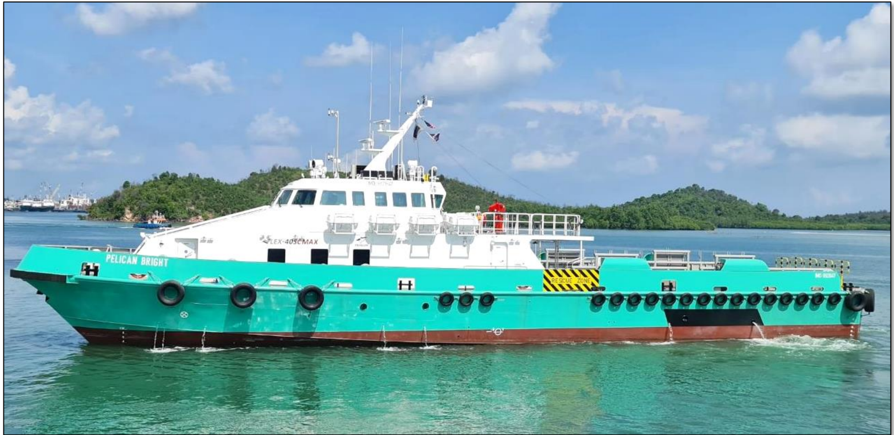
Flex-40SC crewboat Delivered 2 units to our Pelican Group