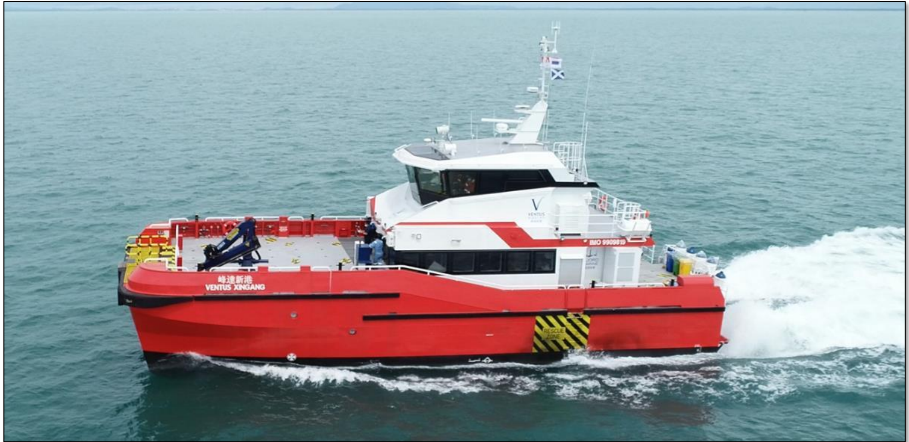
“Ventus Xingang”: 26m Crew Transfer Vessel Delivered to a Taiwanese owner