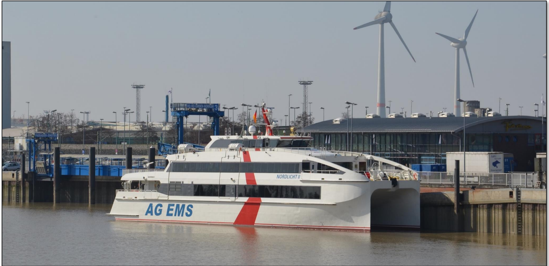
“Nordlicht II”: 46m triple-deck ferry Delivered to a German owner