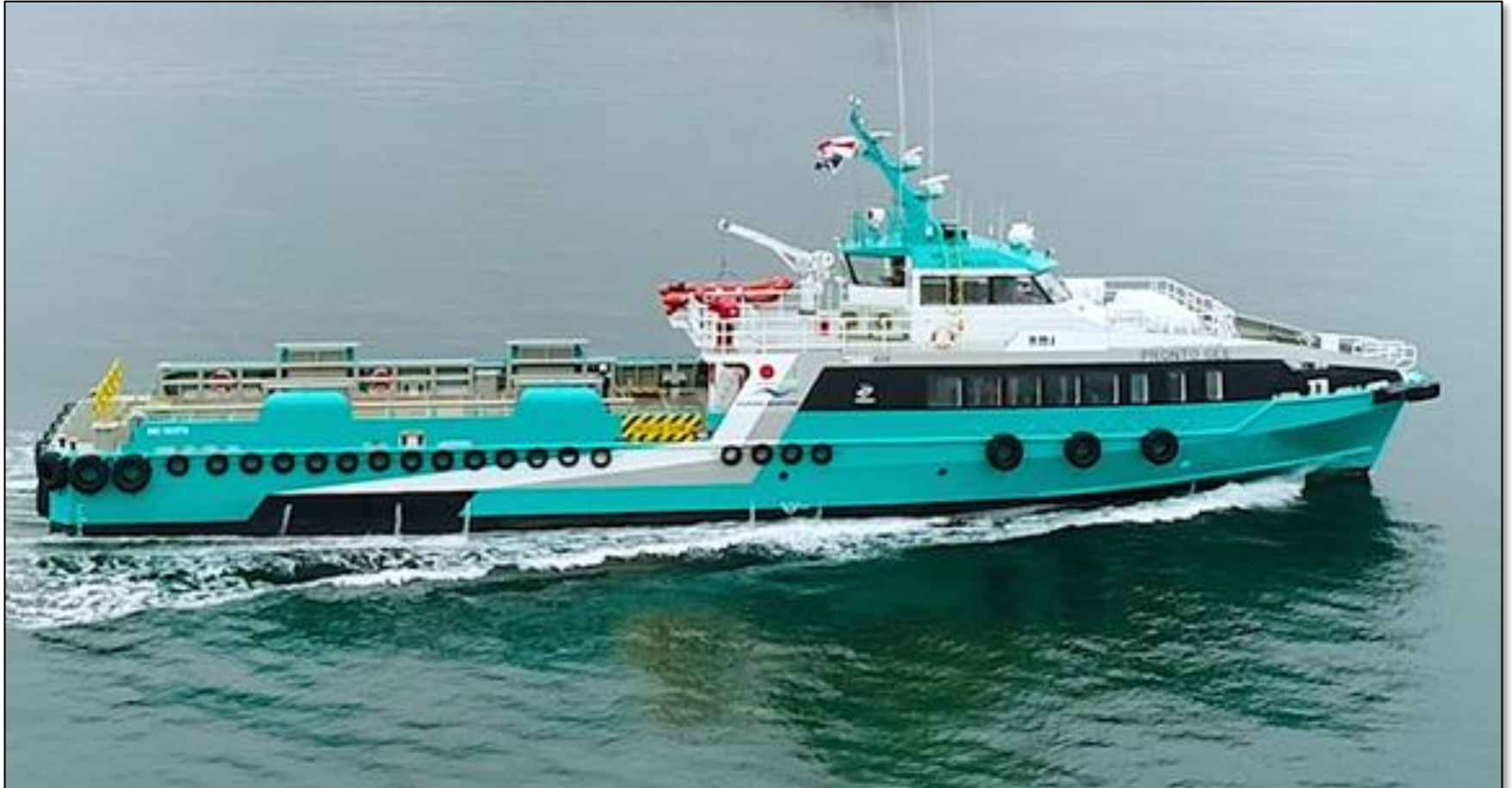
“Pronto Gee”: Flex-42X Executive Fast Crew Boat Delivered to an Egyptian owner