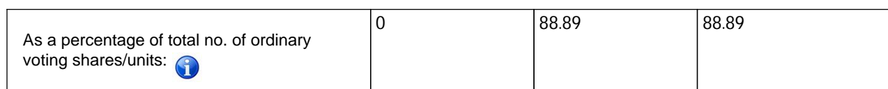
Table 3. Change in respect of rights/options/warrants over shares/units of Listed Issuer