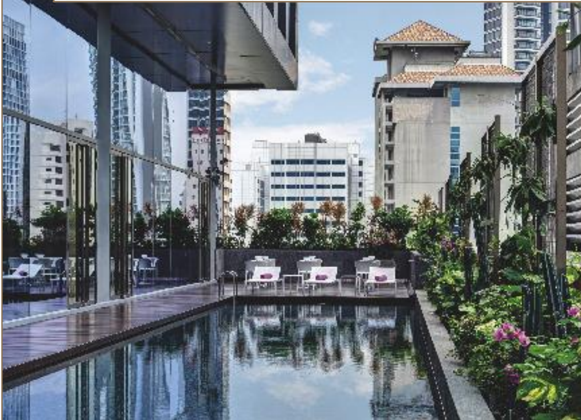
YOTEL Singapore Orchard Road and International Building