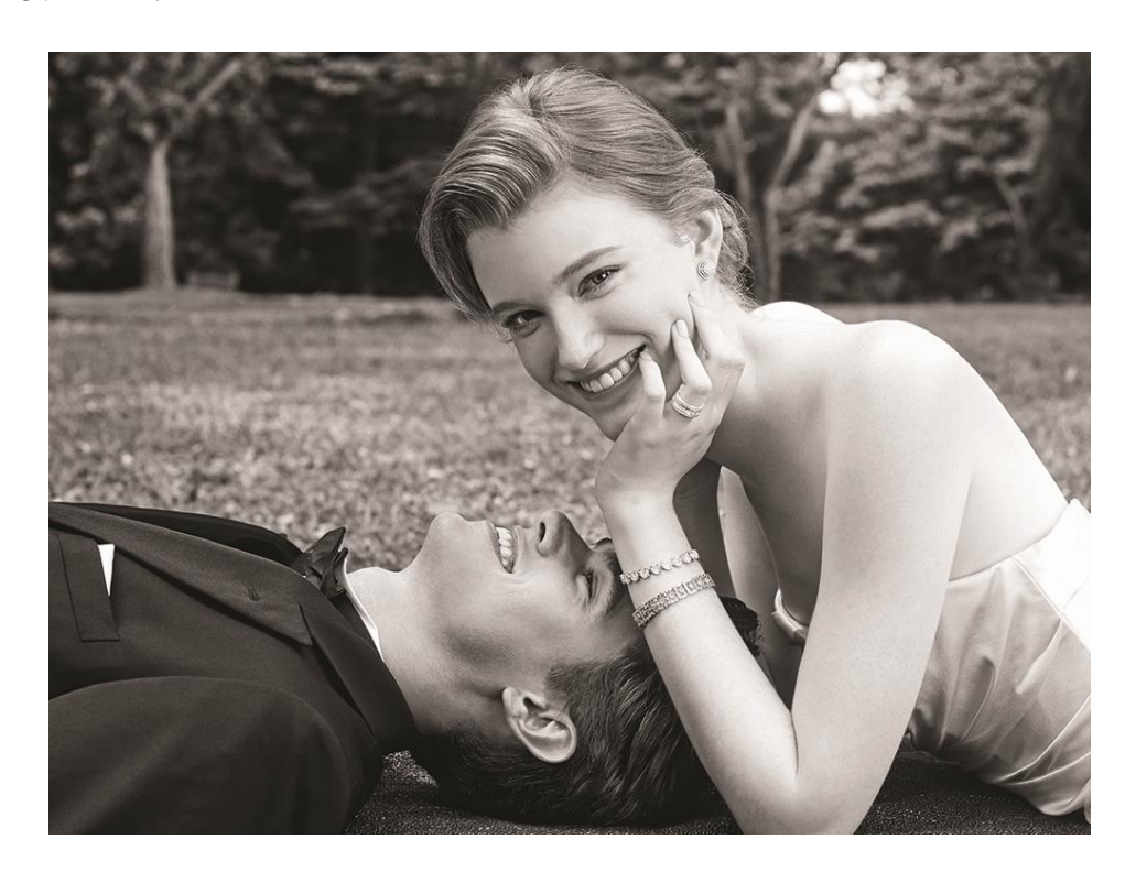
Love & Co., The Love Jewellery Authority

purchasing power and discerning tastes provides an effective avenue for the Group to capitalise upon. This allows the Group to lay the foundation for stronger brand presence within the Thailand market, and also sets the stage for a new era of growth in the country's wedding jewellery sector.