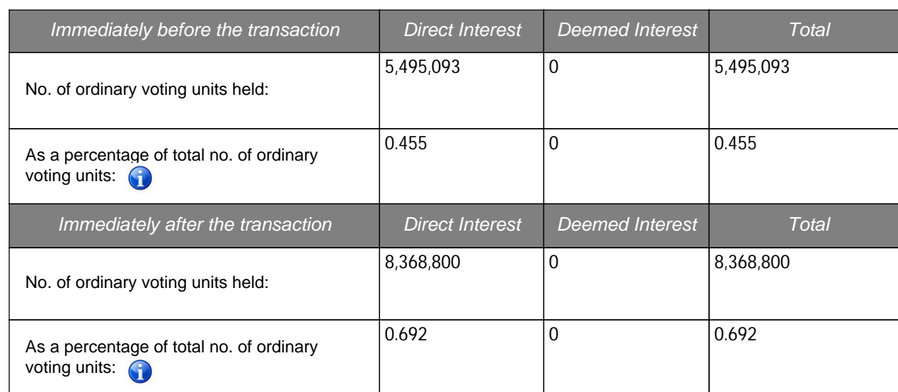
Table 1. Change in respect of ordinary voting units of Listed Issuer