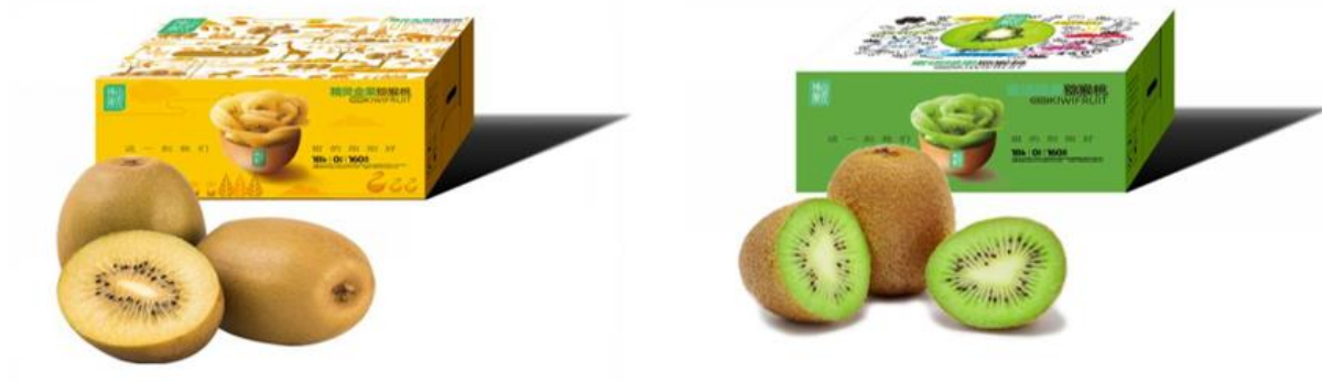
The Xingnong Group's kiwifruit products