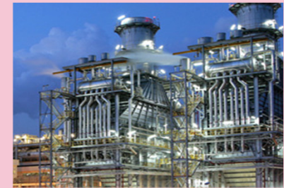
A top-tier 1,300MW gas-fired power plant in Singapore

Acquisition of 51% interest in Keppel Merlimau Cogen Pte. Ltd. (“KMC”) funded by Equity Fund Raising Exercise