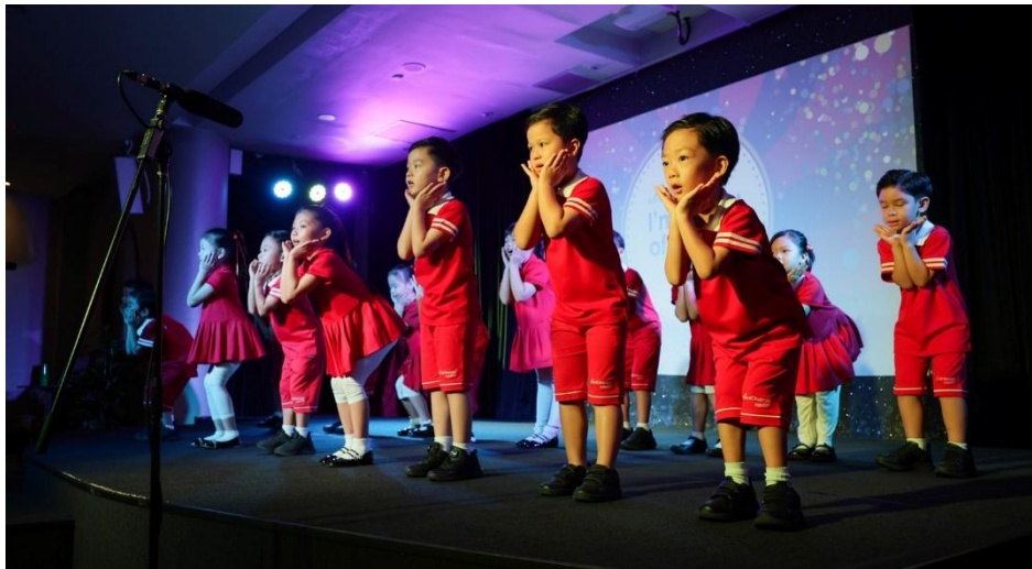
Our K2 Champs from MindChamps PreSchool @ Toa Payoh performing confidently during the cheque presentation ceremony.