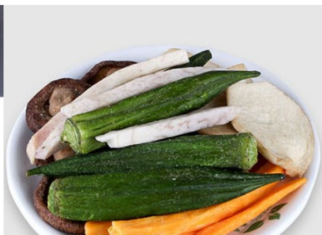
02 Fruits & Vegetables 蔬果系列