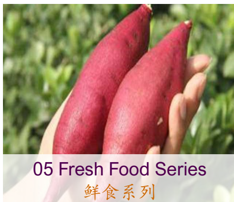
05 Fresh Food Series 鲜食系列