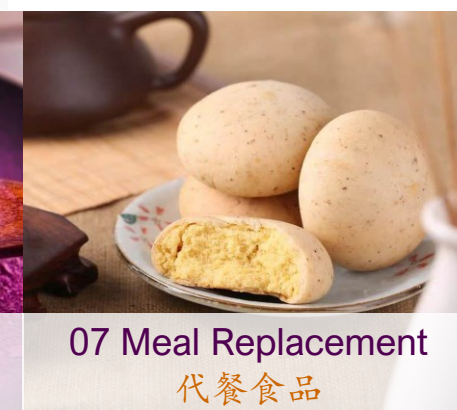
07 Meal Replacement 代餐食品