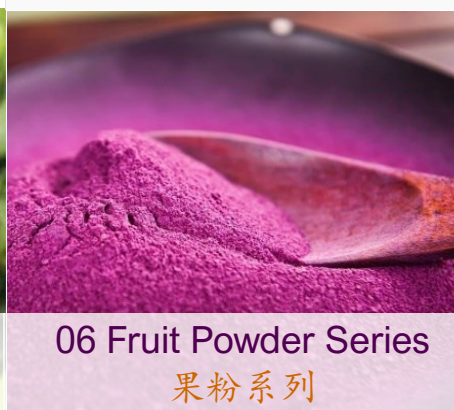
06 Fruit Powder Series 果粉系列