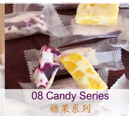
08 Candy Series 糖果系列