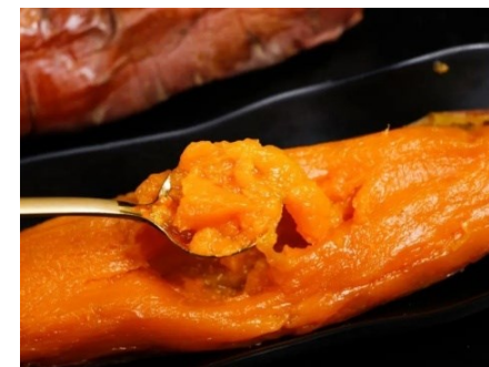
04 Ready-to-eat 即食食品