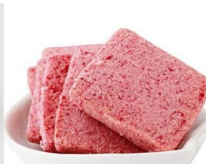
03 Bakery Products 烘培食品