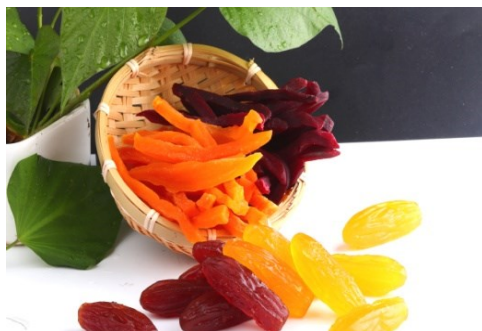
01 Candied Fruit 蜜饯果脯