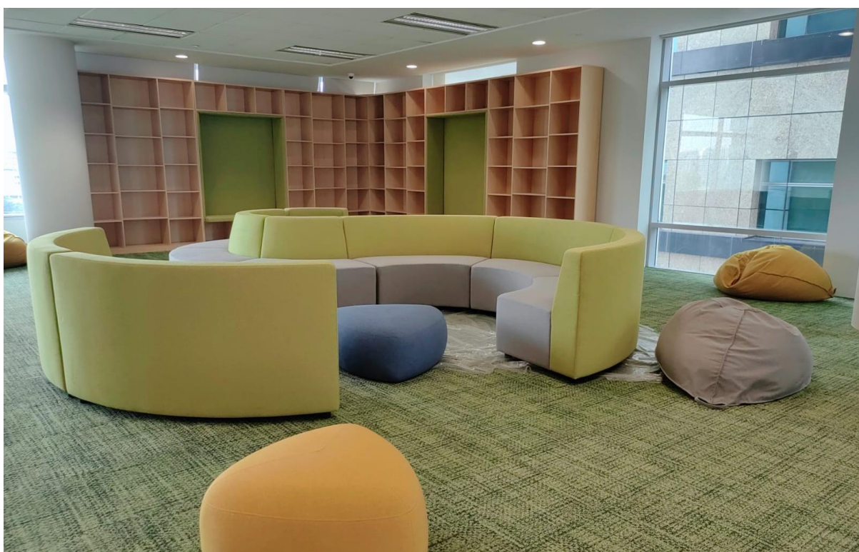
Study and rest area in DIMENSIONS's new Tampines Campus at Asia Green