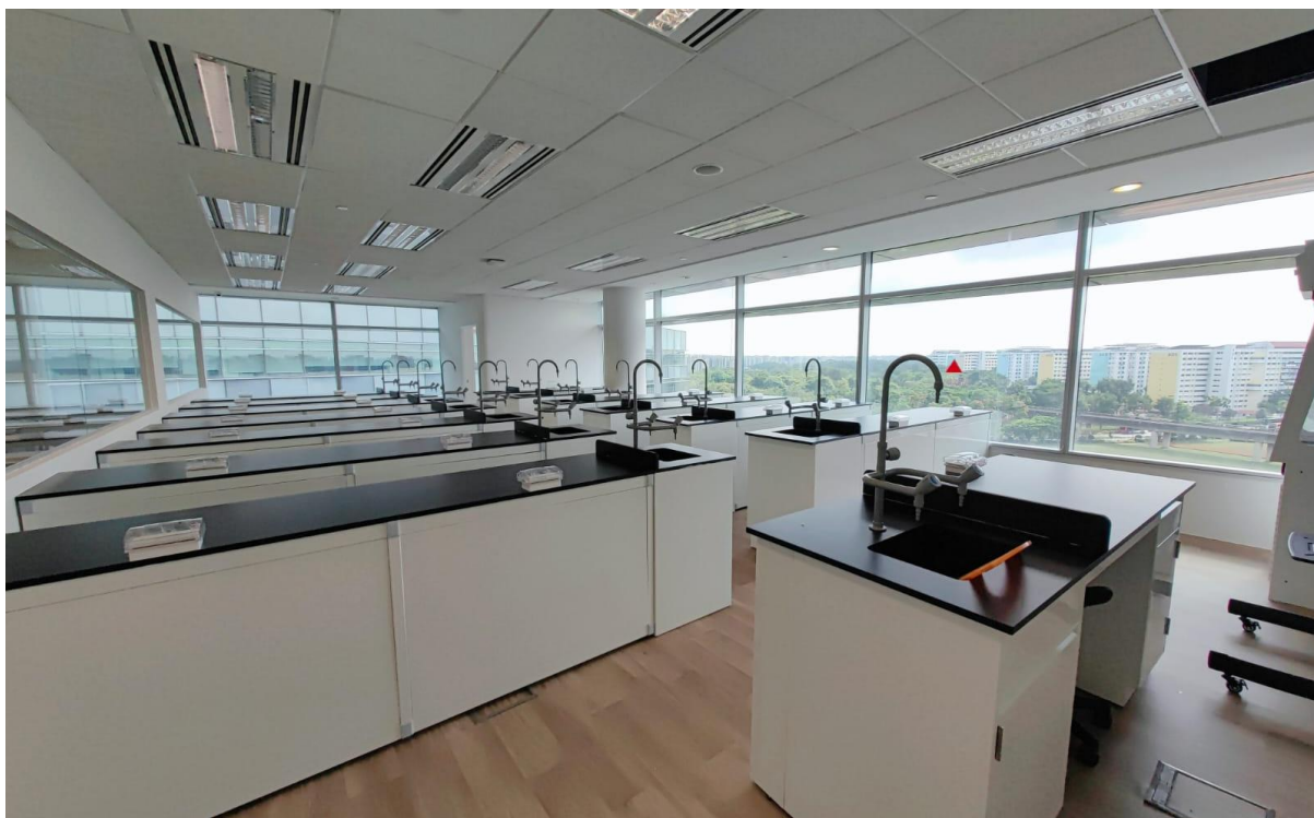
Science laboratory in DIMENSIONS's new Tampines Campus at Asia Green