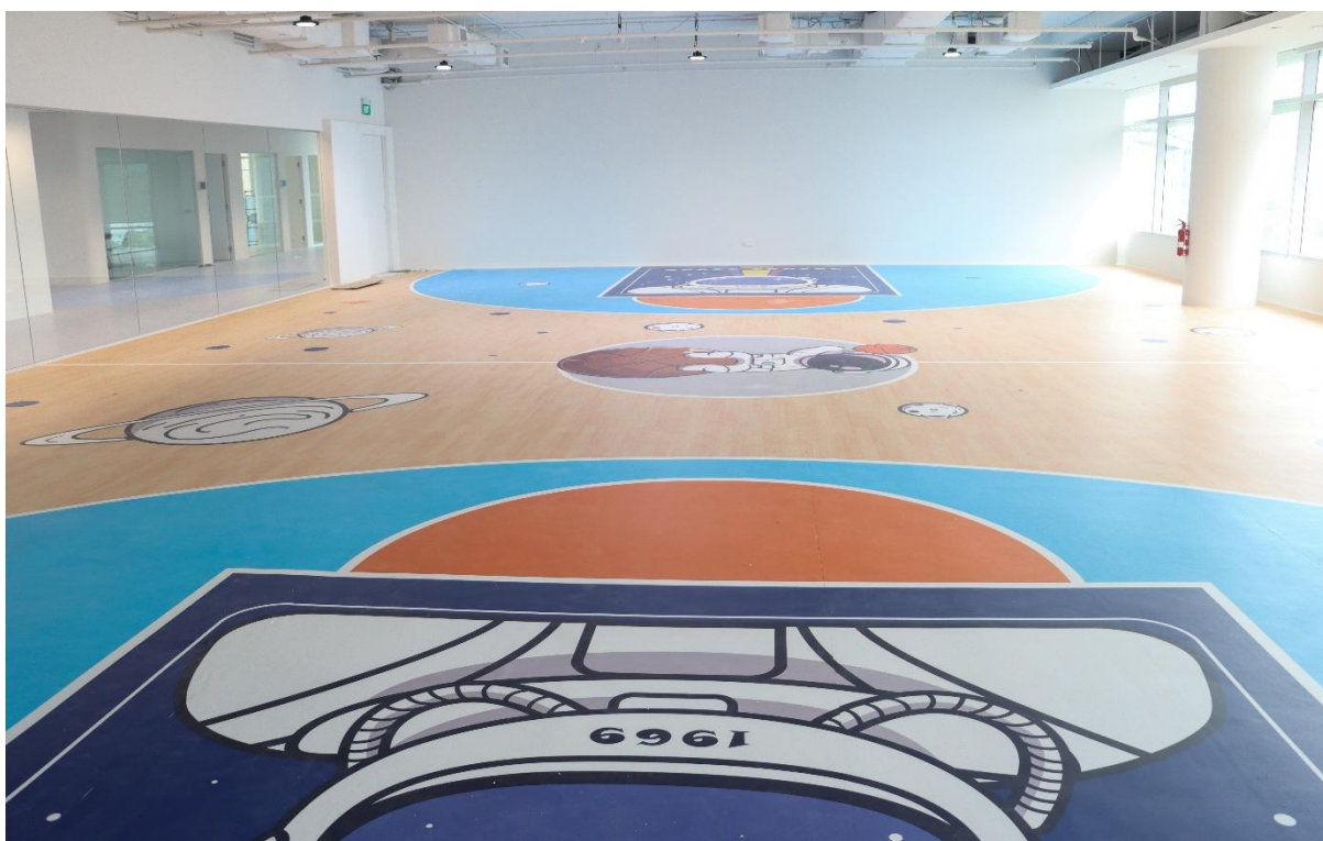
Sports hall in DIMENSIONS's new Tampines Campus at Asia Green