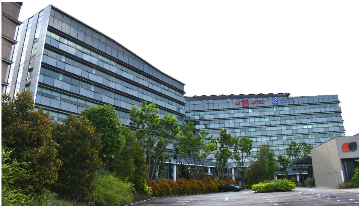
Exterior of Asia Green

Singapore, 7 May 2025 – Mainboard-listed Metro Holdings Limited (“ Metro ” or the “ Group ”) (“美罗控股有限公司”), a property investment and development group backed by established retail operations, announces positive leasing progress achieved for its 50%-owned Asia Green property (“ Asia Green ” or the “ Property ”) in Singapore.