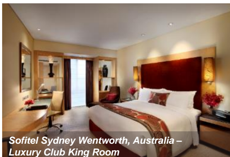
Sofitel Sydney Wentworth, Australia – Luxury Club King Room