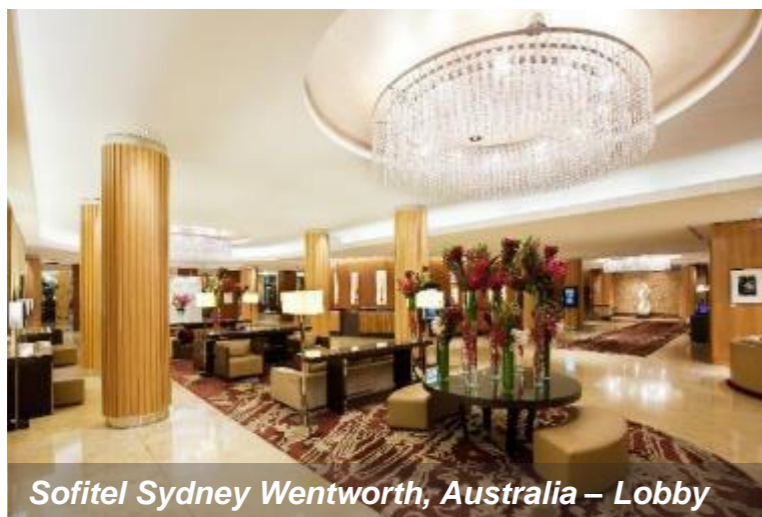
Sofitel Sydney Wentworth, Australia – Lobby