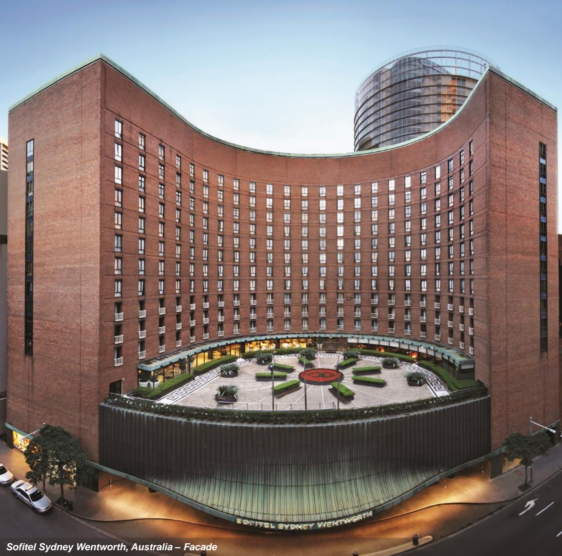
Sofitel Sydney Wentworth, Australia – Facade