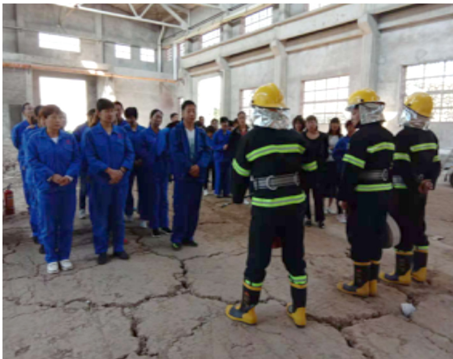
Grain alcohol leakage and fire emergency drill