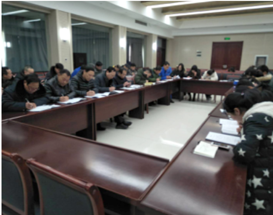
Fire safety knowledge training