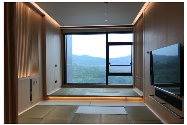
Completed Mock-up Unit