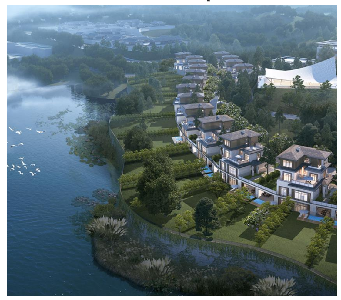
Commercial Villas overlooking Lake Yuhu