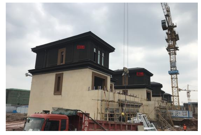
Villas: External Building