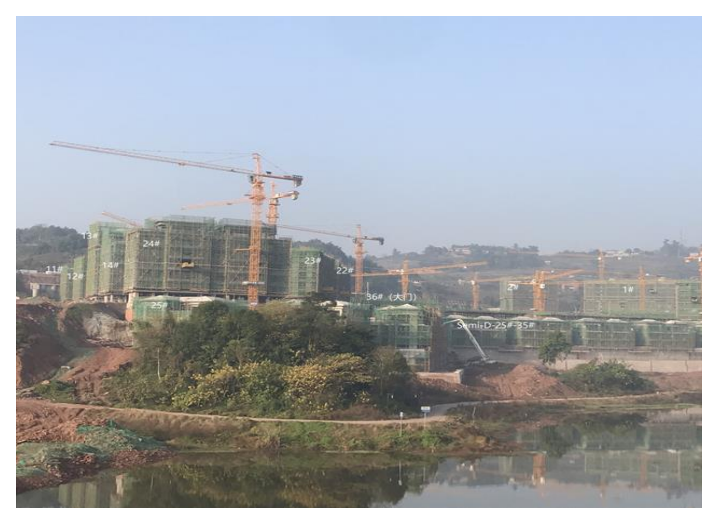
Residential Villas & Semi-D overlooking Lake Yuhu