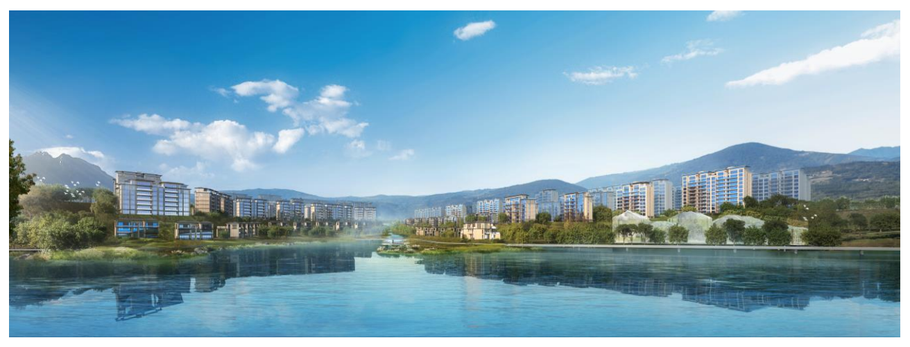
Overlooking Lake Yuhu