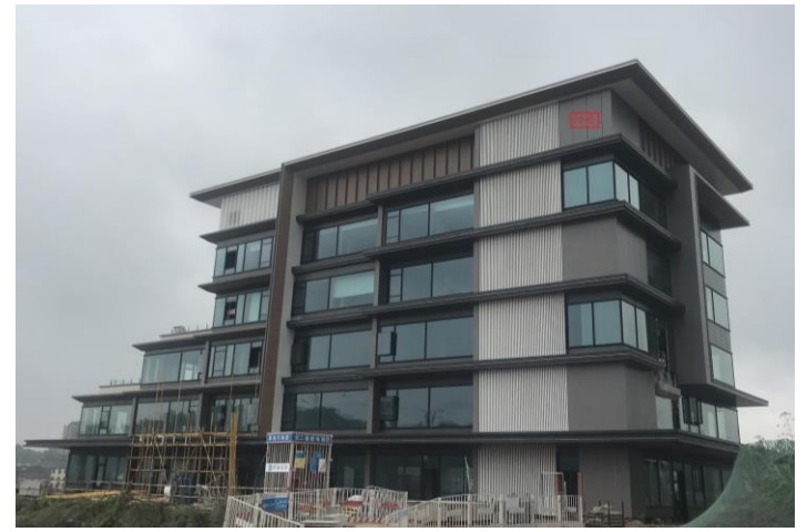
Hotel: External Building