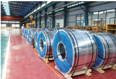
Finished product: Tinplate coil