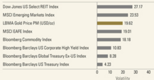
Figure 4: Gold's Volatility Tends to be Lower than Certain Equities

Data from 9/30/07 to 9/30/2017 reflect annualized monthly averages for 120 months. Past performance is no guarantee of future results.