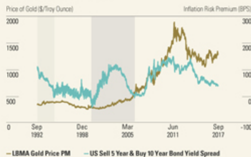
Figure 1: Inflation Risk Premium & Price of Gold Don't Always Move in Lockstep