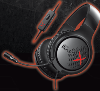
Sound BlasterX H3 PORTABLE ANALOG GAMING HEADSET