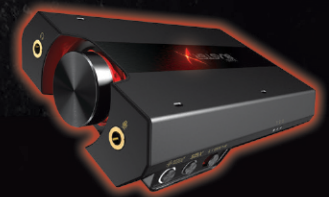
Sound BlasterX G5 7.1 HD AUDIO EXTERNAL SOUND CARD WITH HEADPHONE AMPLIFIER