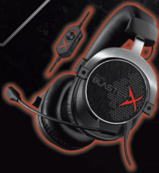
Sound BlasterX H5 PROFESSIONAL ANALOG GAMING HEADSET