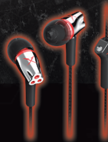
Sound BlasterX P5 HIGH-PERFORMANCE IN-EAR GAMING HEADSET