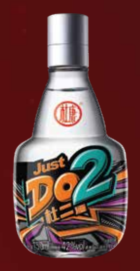
Dukang No.2 (regular series) 杜二