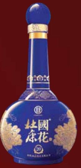
20 Years - Guohua Dukang Series 20年-图花社康系列