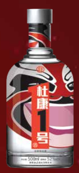
Dukang No.1 (premium series) 杜康1号