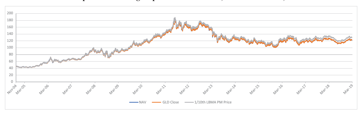
Share price & NAV v. gold price - November 18, 2004 to March 31, 2019

Investing in the Shares does not insulate the investor from certain risks, including price volatility. The following chart illustrates the movement in the price of the Shares and NAV of the Shares against the corresponding gold price (per 1/10 of an oz. of gold) since the day the Shares first began trading on the NYSE: