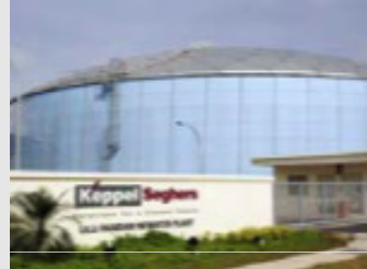
Ulu Pandan Plant