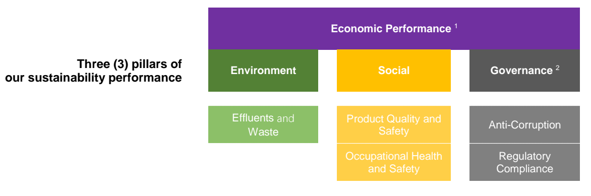
Exhibit 1. Spindex's Sustainability Performance Management Framework

Under this framework, we have defined key pillars and the non-financial topics that are material to the sustainability of our economic performance and business operations.