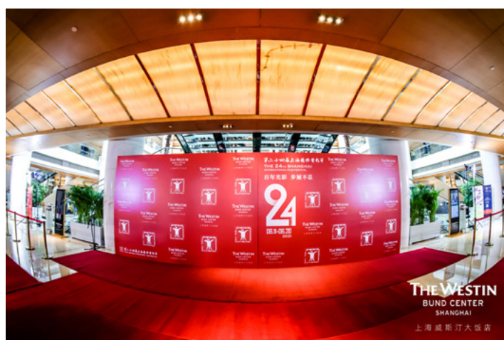
Shanghai International Film Festival

The hotel continued to maintain commendable guest satisfaction increase over the last year by 5.1 points. The employee engagement index score was 96% for the year 2021.