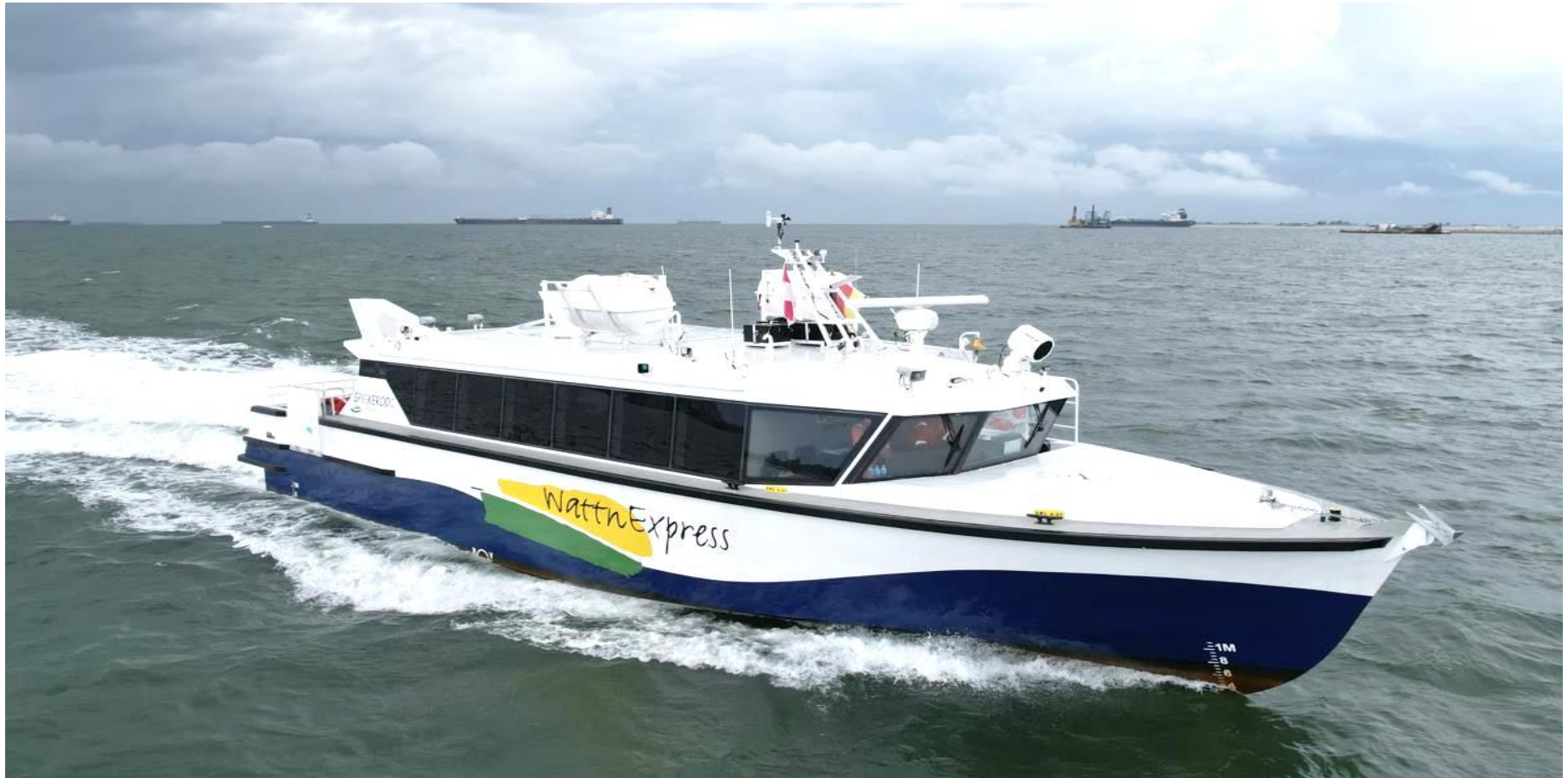
18m Coastal Ferries Delivered 2 units to a German owner