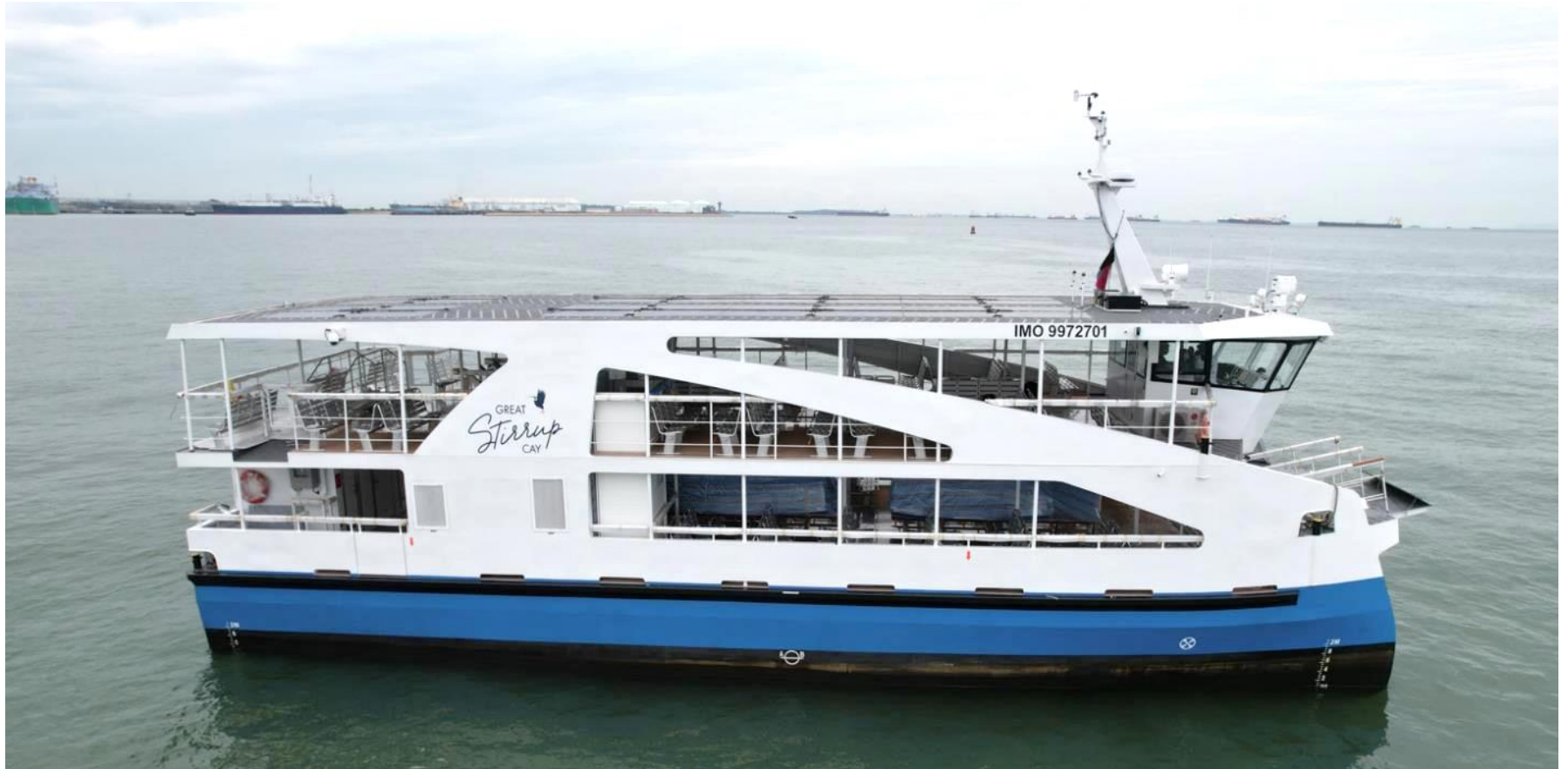
25m Cruise Tender Ferries Delivered 3 units to a North American owner