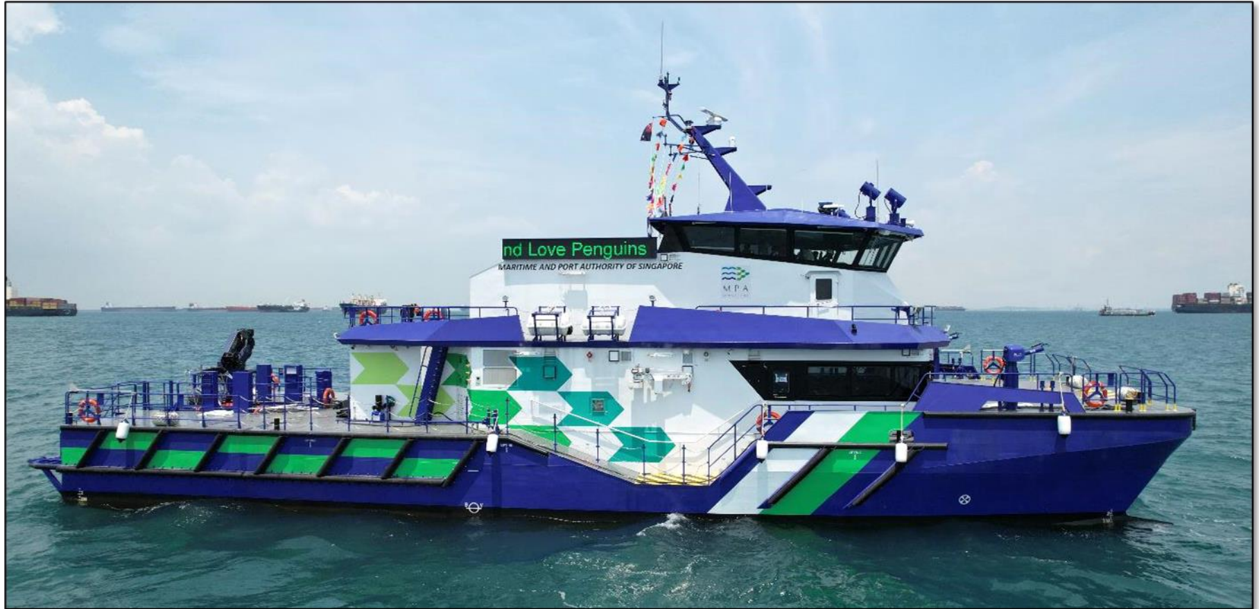
35m Hybrid-Electric Patrol Boat Delivered 1 unit to the Maritime and Port Authority of Singapore