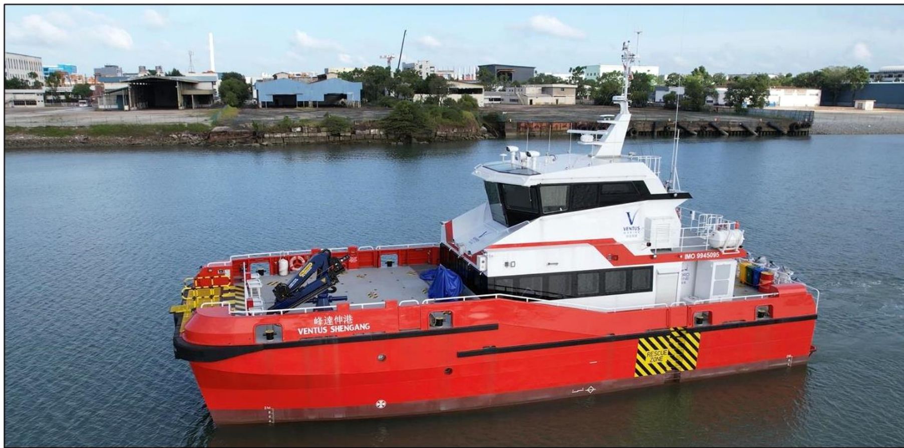
26m Windfarm Crew Transfer Vessel Delivered 1 unit to a Taiwanese owner