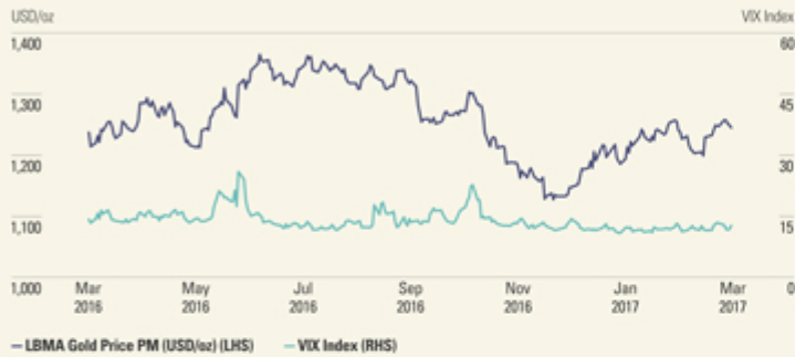
Figure 5: Stock Market Volatility

Bullion found support from a covering of speculative short positions on the COMEX as ETF holdings regained their footing following a lackluster Q4 2016.