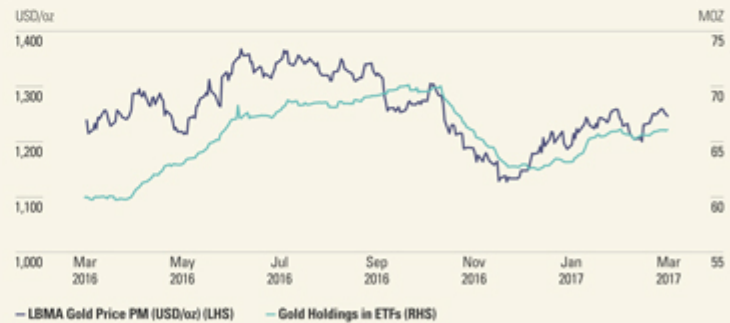
Figure 8: Gold ETF Holdings 1