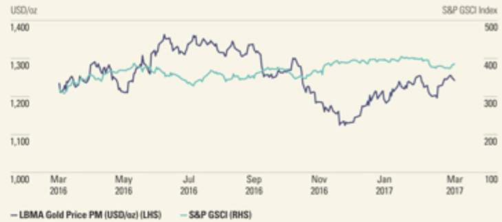
Figure 3: Gold and Commodities