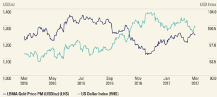
Figure 1: Gold and US Dollar Index

Gold bounces higher from losses made in Q4 2016 spurred by a softer USD and tighter US Treasury yields.