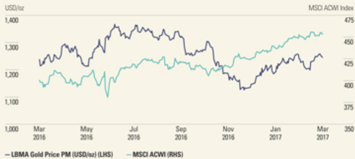
Figure 2: Gold and Equities