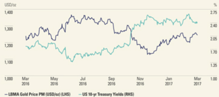
Figure 4: Gold and 10-Year Treasury Yields