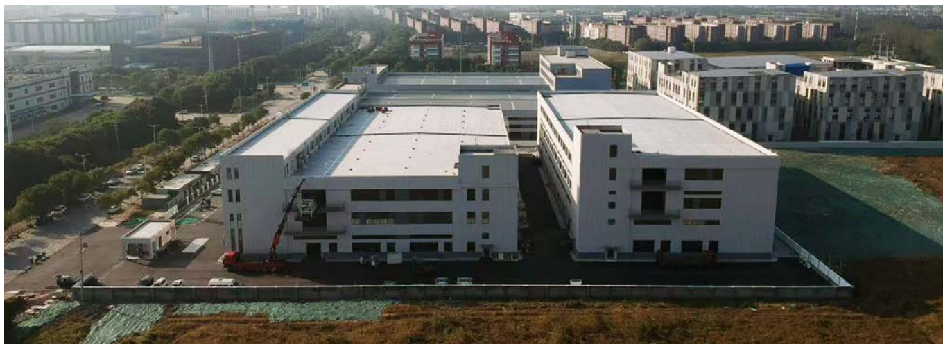
Jiangsu Jiarte New Material Technology Co., Ltd