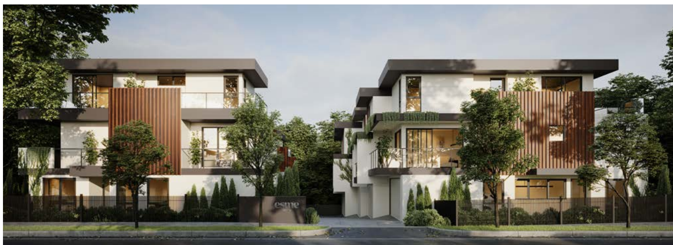
Blackburn Property (Australia, Melbourne)