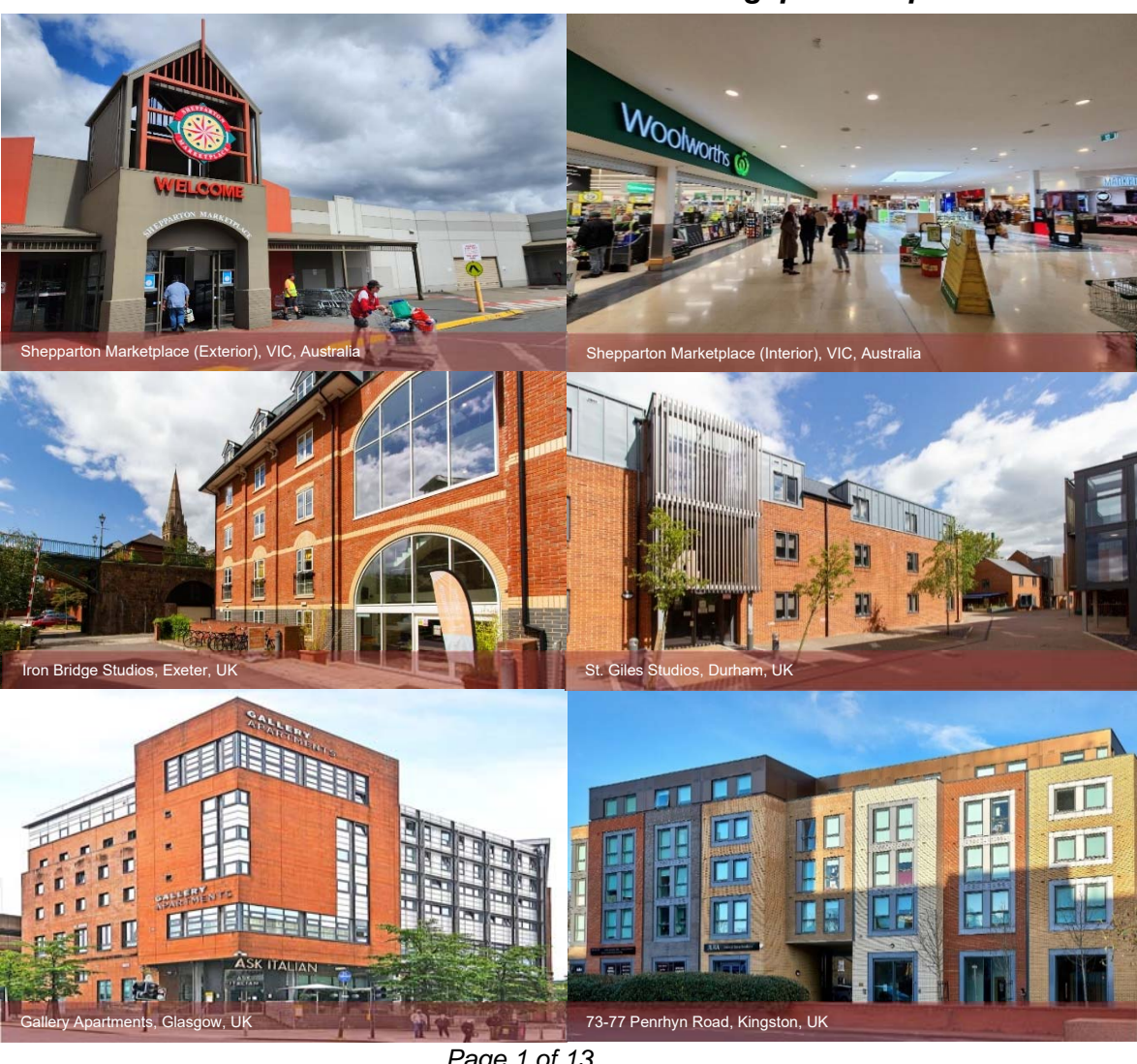
Page 1 of 13