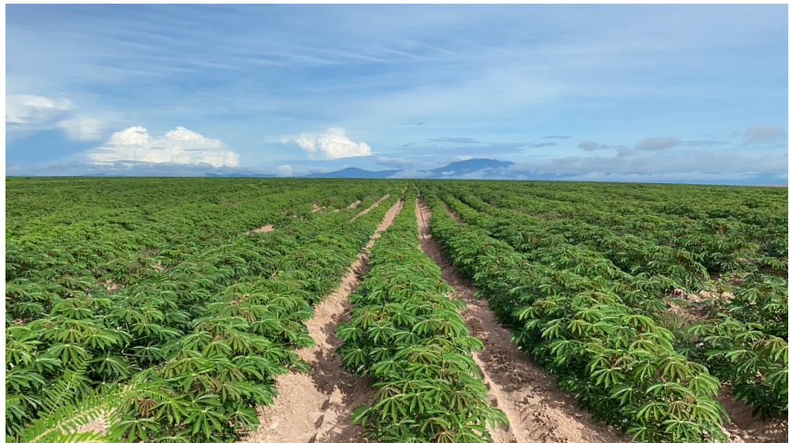
(Artist Impression only)

The Project will be able to attract an estimated investment value of USD 10 billion and create more than 500,000 direct and indirect job opportunities in the Kingdom of Cambodia.