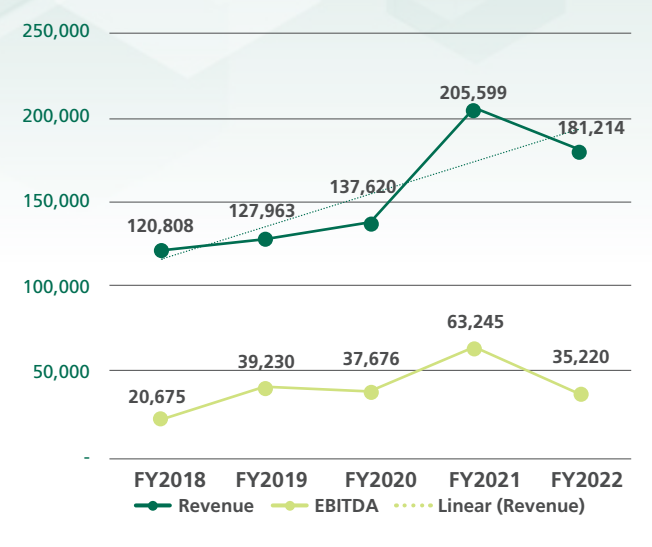
Chart 1: Group Total: Revenue & EBITDA (S$'000)