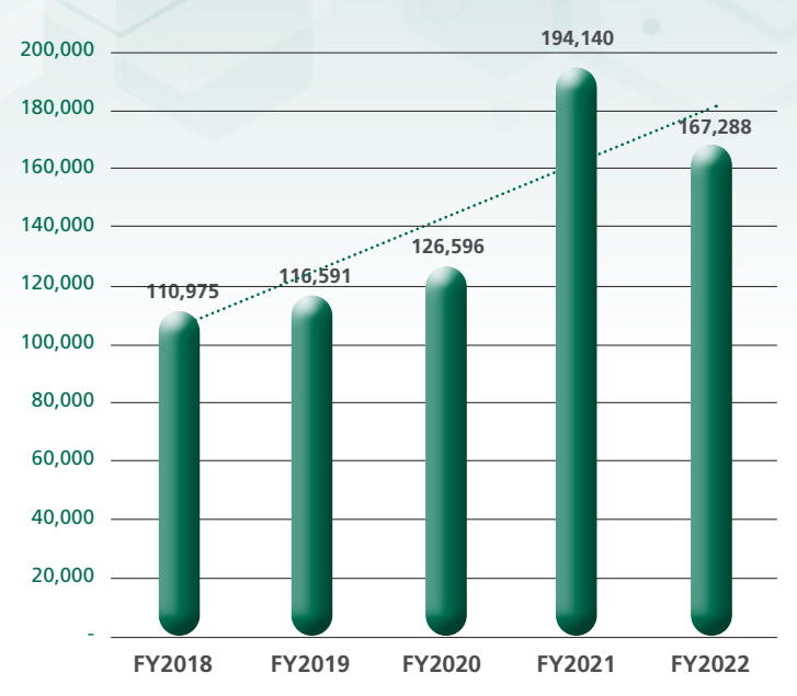
Chart 4: Revenue by Country- Singapore ($$'000)