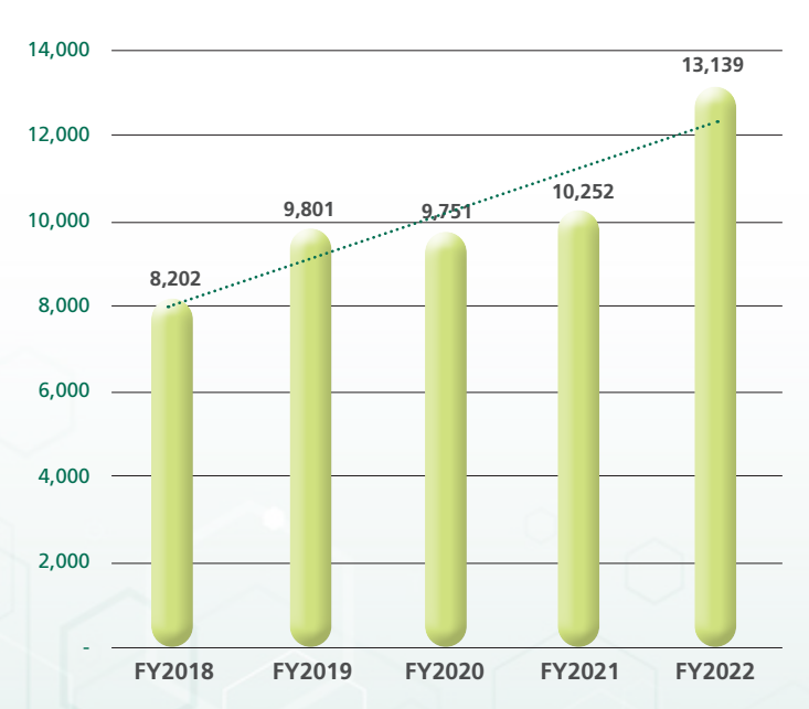
Chart 5: Revenue by Country- Malaysia ($$'000)