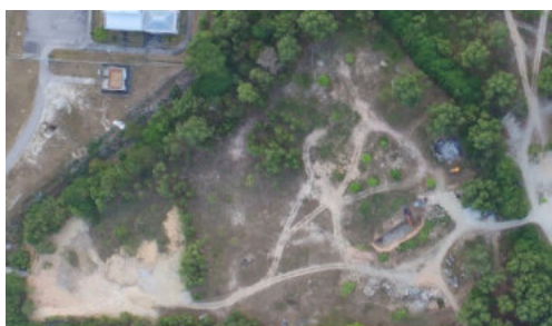
ESCAPE Waterplay - prior to construction