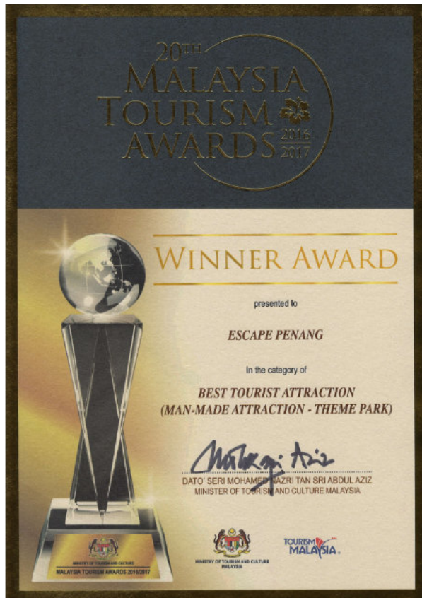
Malaysian Tourism Awards 2016/2017 Best Tourist Attraction - Man-made Attraction