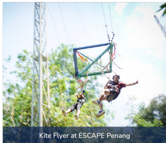
Kite Flyer at ESCAPE Penang