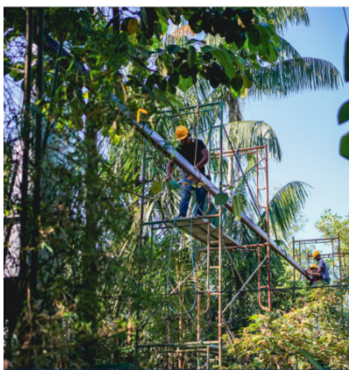
The Zip Coaster was constructed with minimal impact to the environment