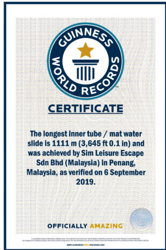
Guinness World Records Longest Tube Water Slide - 1,111m