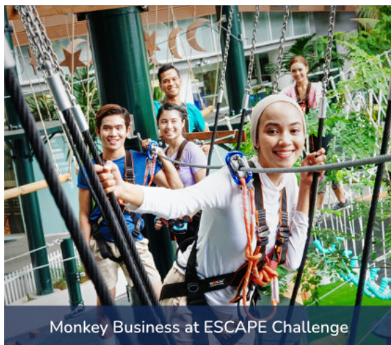
Monkey Business at ESCAPE Challenge

Many of ESCAPE's attractions do not require electricity at all including our rope and obstacle courses which have guests navigating through the rainforest, flying trapeze and zipline attractions, our downhill trike ride and a tubing ride that uses artificial ski tracks from our Gravityplay hill top.