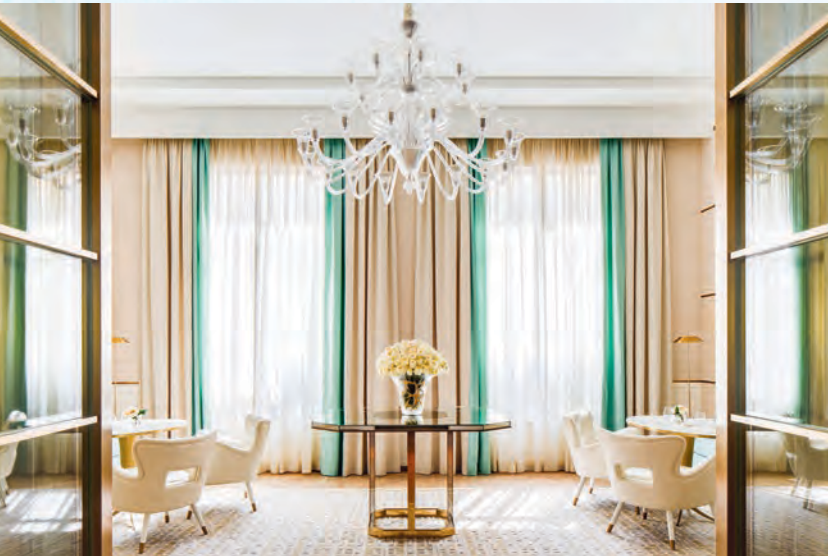
Lanson Place Causeway Bay Hong Kong