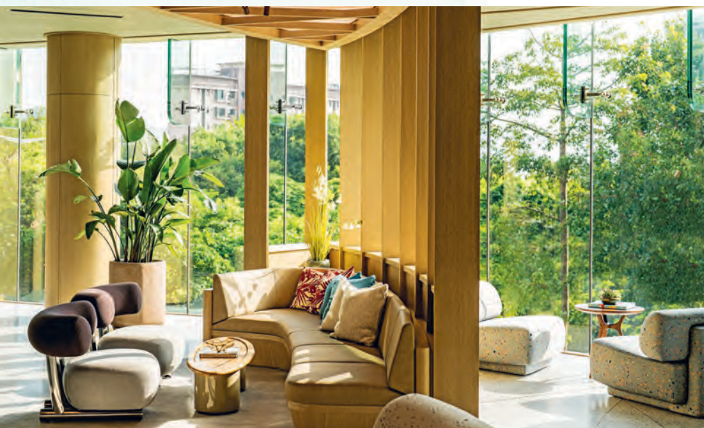
Overlooking the coastline of Castle Peak Bay, Hong Kong, OMA by the Sea offers resort-inspired living with modern, earth-toned aesthetics.